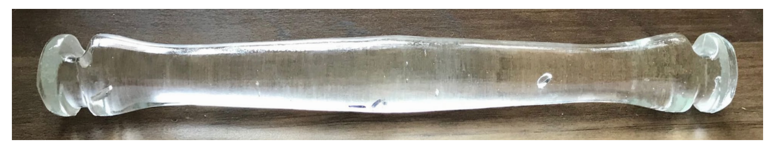
STYLE 3: UNEMBOSSED, THICKER "NECK" WITH ASYMMETRICAL WIRE GROOVES (SQUARE AND ROUND).