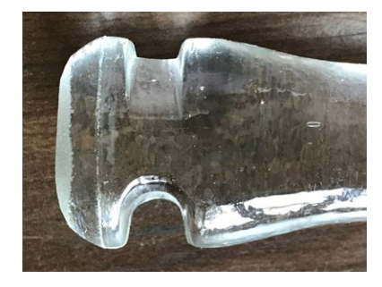
STYLE 3 CLOSEUP OF WIRE GROOVE.