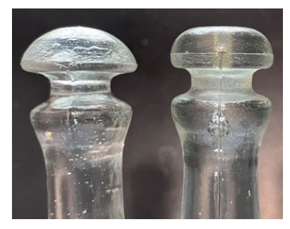
STYLE 1 VS. STYLE 2 END DESIGNS