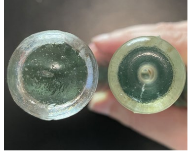
STYLE 1 VS. STYLE 2 END DESIGNS