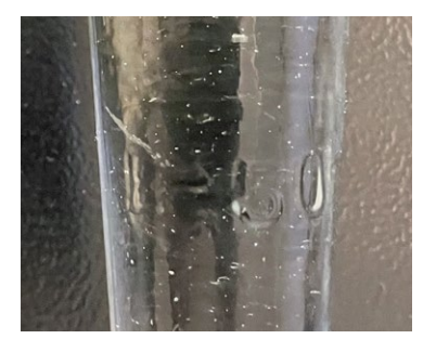
STYLE 1 E-50 EMBOSSING CLOSEUP